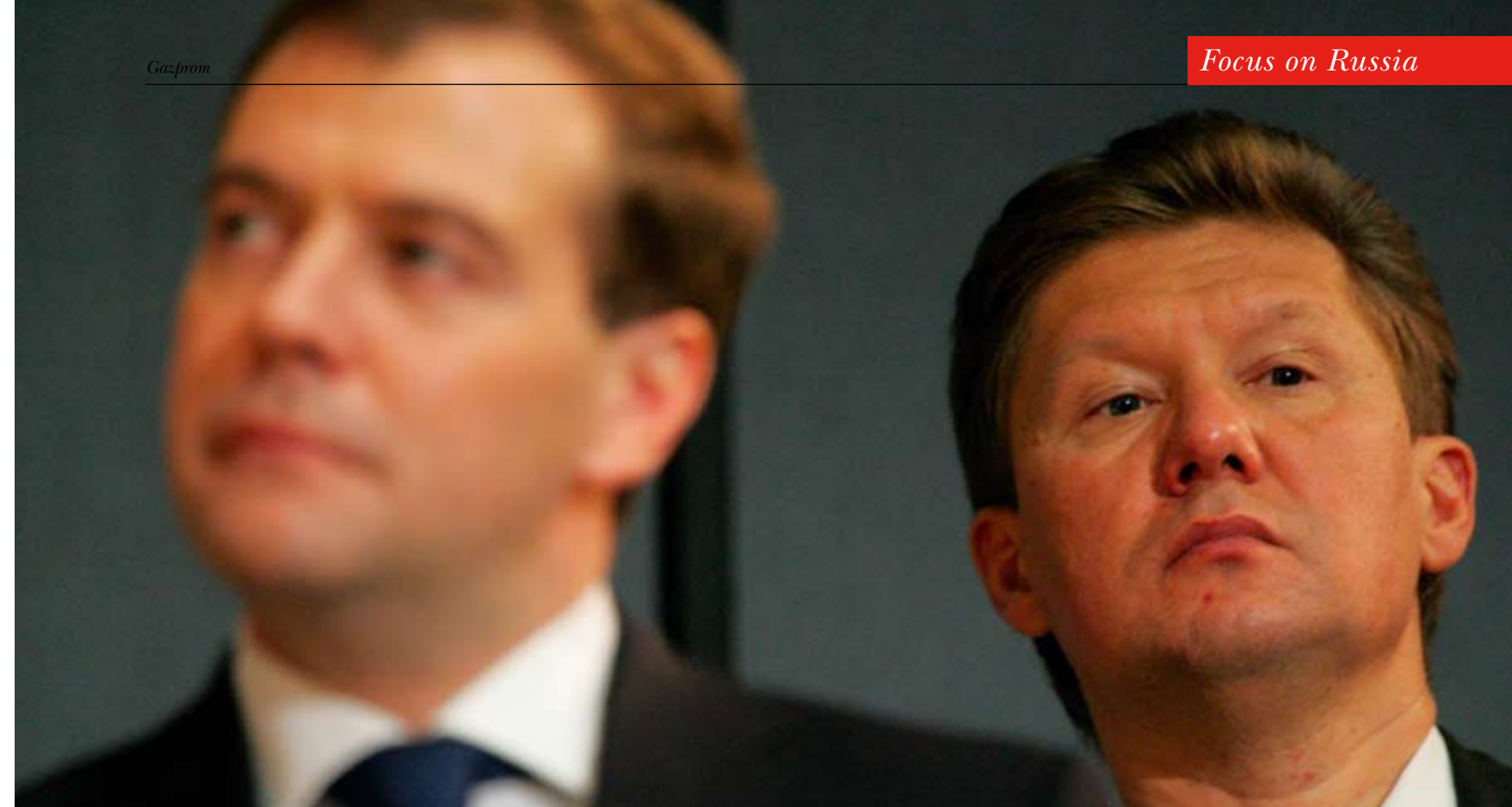
Russian President Dmitry Medvedev and Gazprom chief executive Alexei Miller.

The Soviet Union became the world's largest producer of natural gas in 1984. Two years later, Russia started producing gas from its "super-giant" Yamburg field. The field is operated by Gazprom subsidiary Gazprom Dobycha Yamburg, which accounted for 41.6% of Gazprom's total gas output and 34% of Russia's total production in 2006. Today Gazprom's traditional three super-giant fields, i.e. fields containing over 850 billion m 3 (bcm) of gas – Urengoi, Yamburg and Medvezhye – still make up the bulk of Russian production.